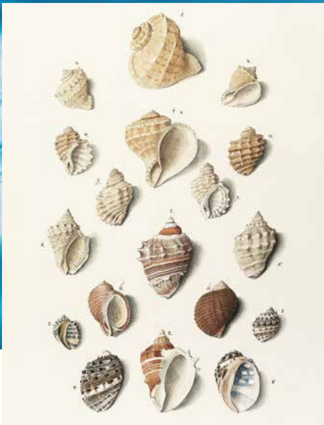
Franz Anton von Scheidel, details from "Depictions of conchiliae in watercolour after Johann Carl Megerle von Mühlfeld (1765–1840)," late 18th century